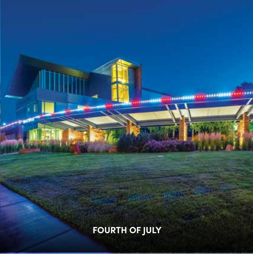
FOURTH OF JULY