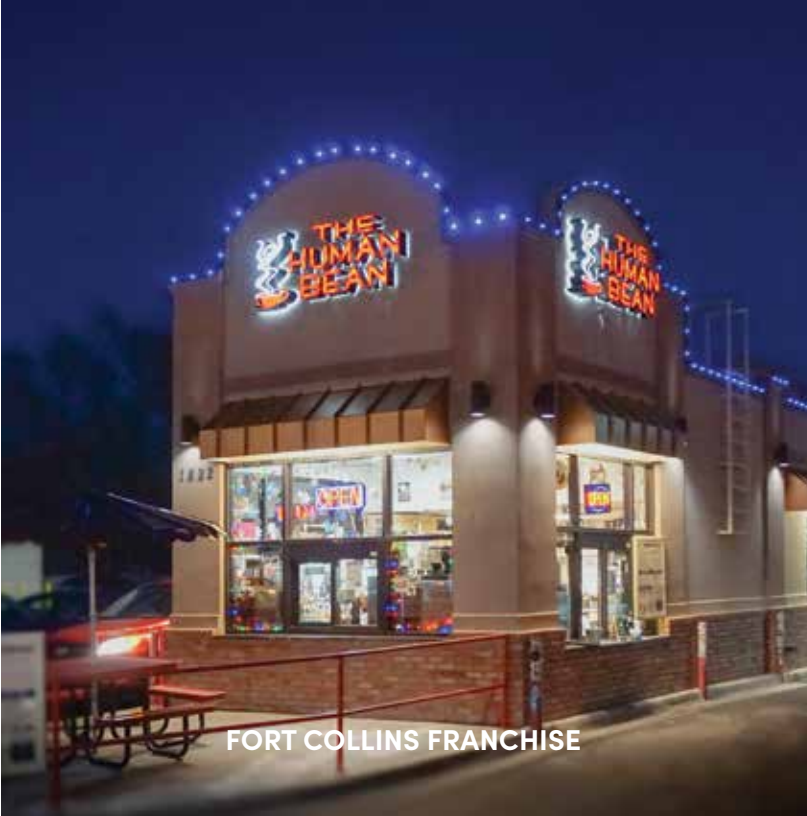
FORT COLLINS FRANCHISE