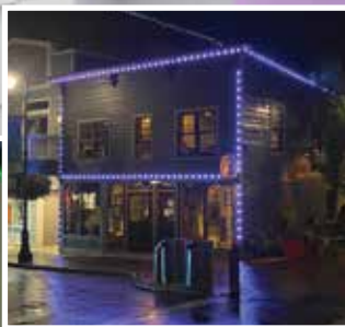
SIDE MOUNT, TOO!