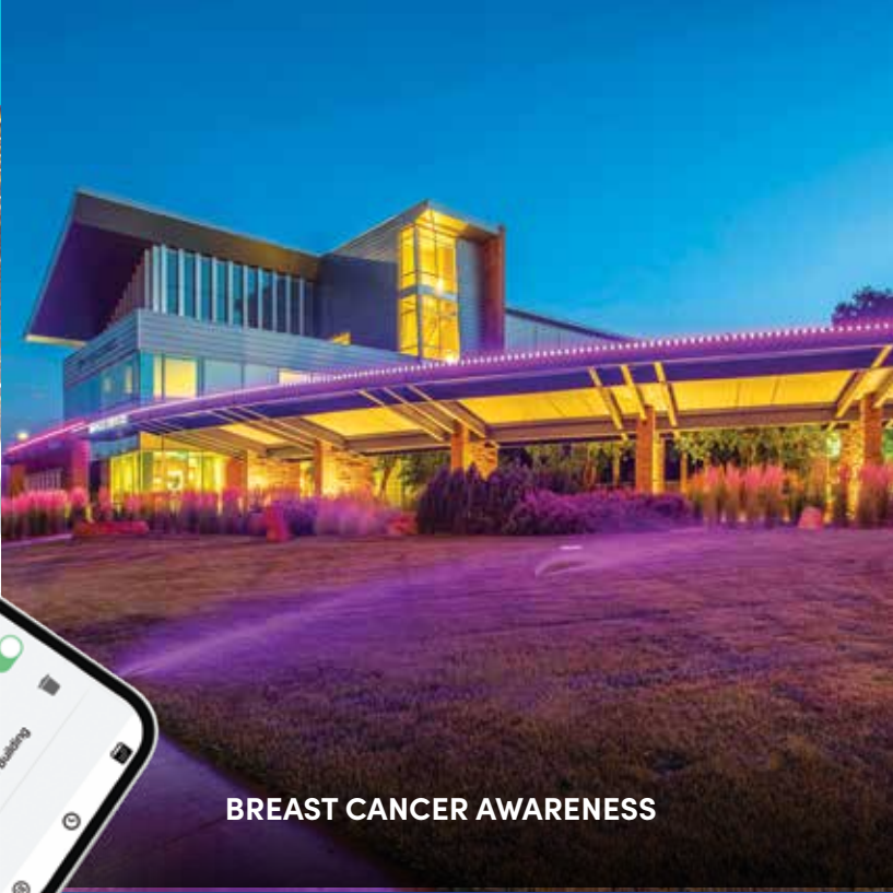
BREAST CANCER AWARENESS