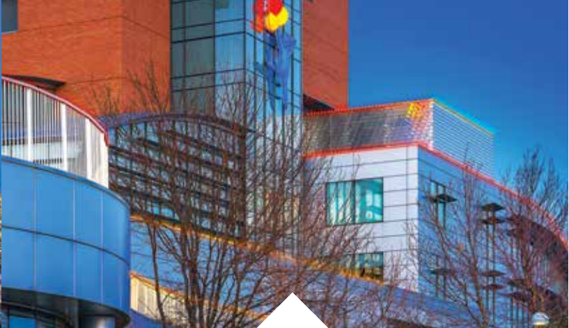
CHILDREN'S HOSPITAL COLORADO