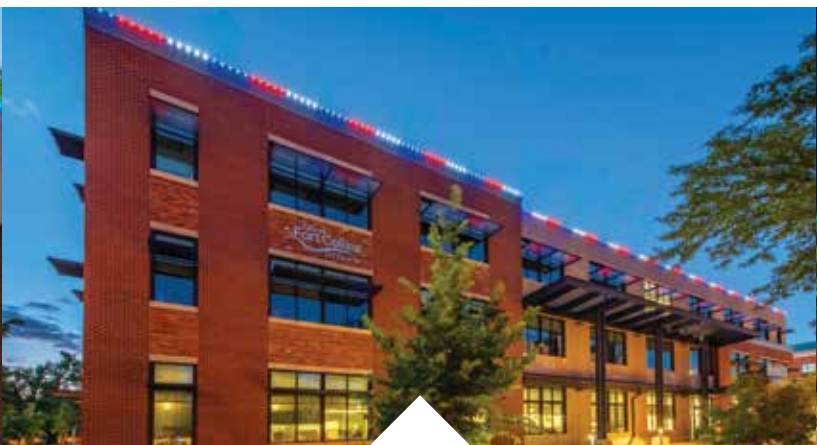
THE CITY OF FORT COLLINS