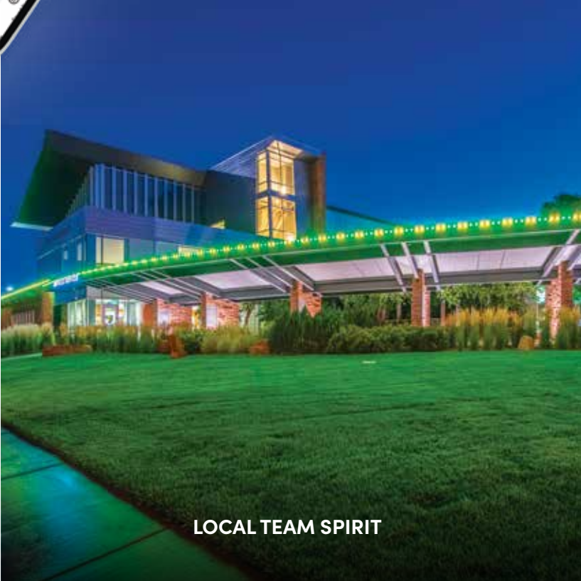
LOCAL TEAM SPIRIT